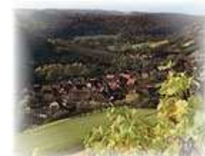
The Tauber valley