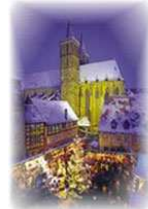
Christmas market with St. Jacobs church

Enjoy Rothenburg and the lovely Tauber valley with its Magnificent sights.