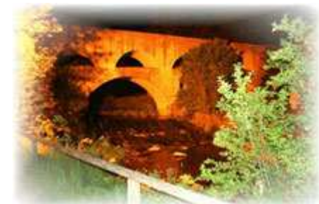
Double bridge at night